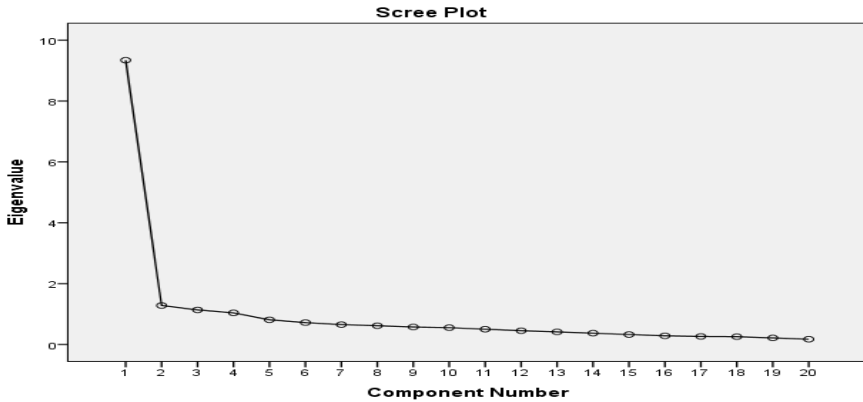
Figure 2: Scree plot test

component, the four-factor solution suggested by PCA's eigenvalue indices was eventually adopted which was more conveniently aligned with the theoretical framework in question.